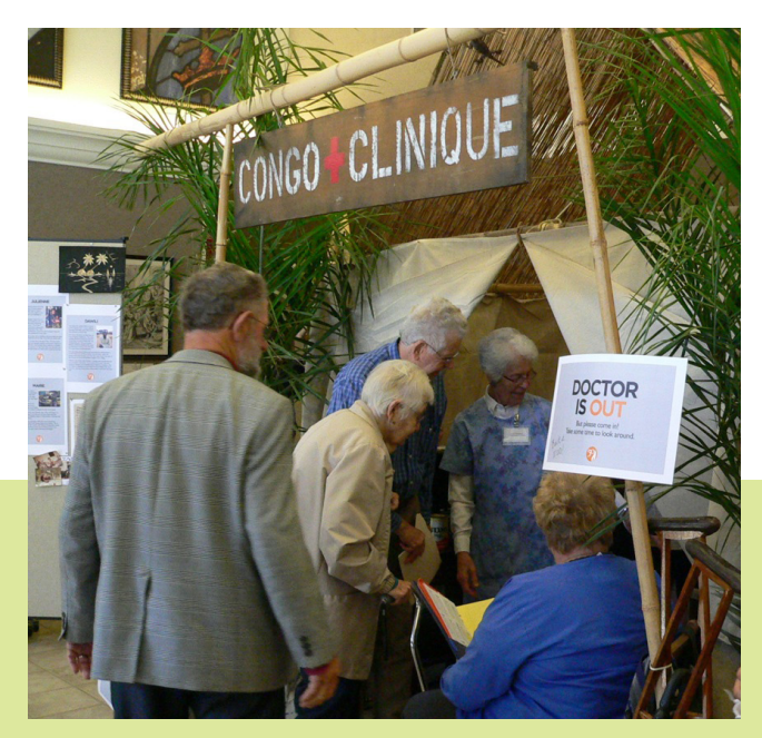
The Congo Clinic Experience set up by Hilmar Covenant Church.

culture and information for transformation. By meeting regularly (we suggest monthly), this leadership team will develop a plan including a time-line of activities, persons responsible, and how to communicate Congo to the congregation.